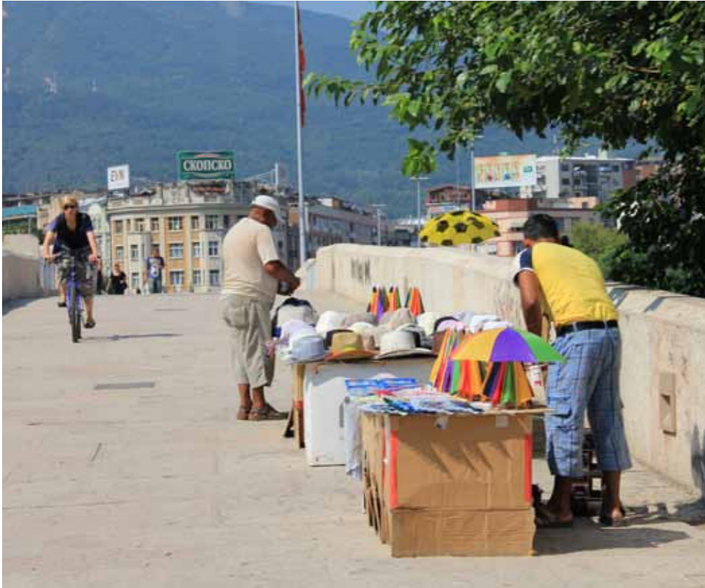
Street vendors in Skopje, July 2011.