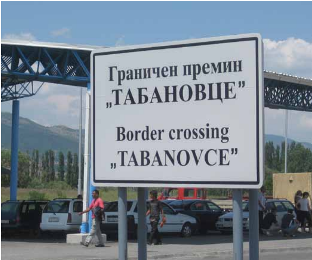
Bottleneck: border crossing between Macedonia and Serbia, July 2011.