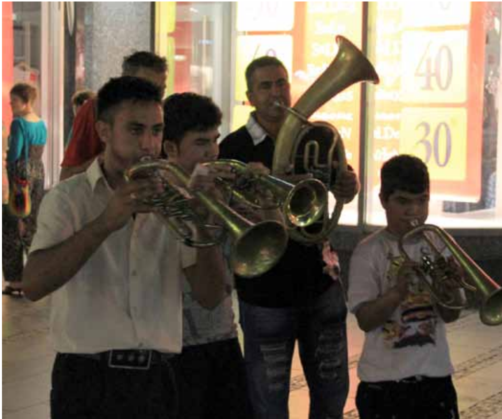
Musicians in Belgrade, July 2011.