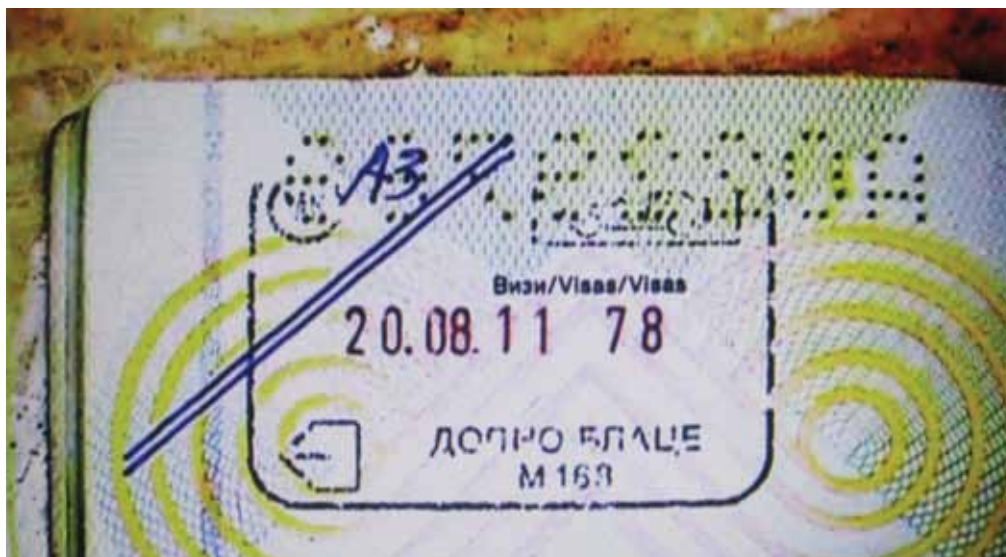
Not allowed to leave

Reports provide an indication of the highly arbitrary character of these controls and the exit bans they entail.